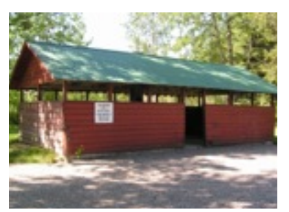
May - September

Owned and operated by the Town of Sundre, Greenwood Campground is located two blocks south of the traffic lights. The campground is open for the May long weekend and typically closes late September.